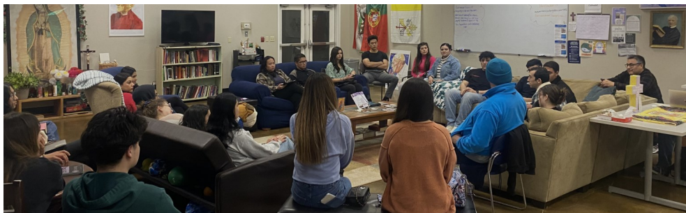
Record Breaking Attendance Young Adult Bible Study

Join us for Mass at Fresno State this Thursday, March 7 at 12:30pm. We'll be in the Resnick Student Union. Follow our Instagram for more info.