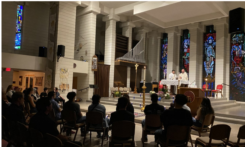
Wednesday Student Night Mass

Join us for an evening of worship music and s'mores making! This Friday, April 26th at 6:30pm, outside the student lounge. See you there!