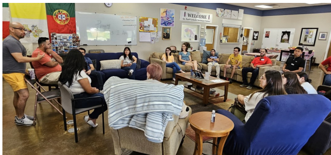
Young Adult Retreat last Saturday

Next year, in July 2025, our young adults have an extraordinary chance to participate on a pilgrimage to Rome, a journey that promises to radically deepen their spiritual growth. To make this pilgrimage possible, our young adults will be hosting a snow cone fundraiser next weekend, July 27th and 28th in the courtyard after each Mass. Each purchase of a refreshing snow cone will directly contribute to funding their journey of faith. Thank You!