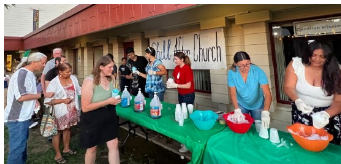
Snow Cone Fundraiser

Thank you to everyone that supported our snow cone fundraiser. We had a successful weekend and are grateful for you. We had a great response and many requests to be available this weekend as well! So join us for part two of our Chill After Church fundraiser! We will be making snow cones after each mass in the courtyard for $5.