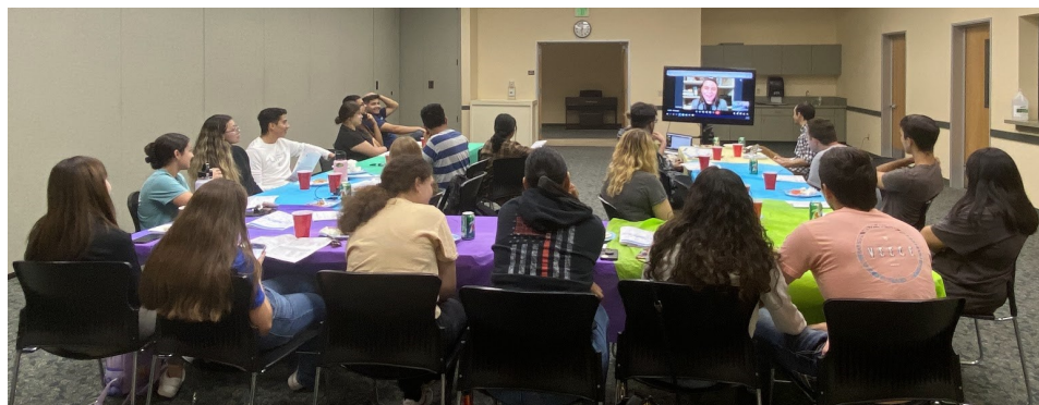
Young adults gather to learn about voting initiatives.