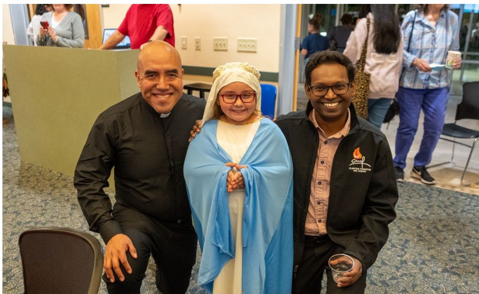
Faith, Family & Friends All Saint's Day party