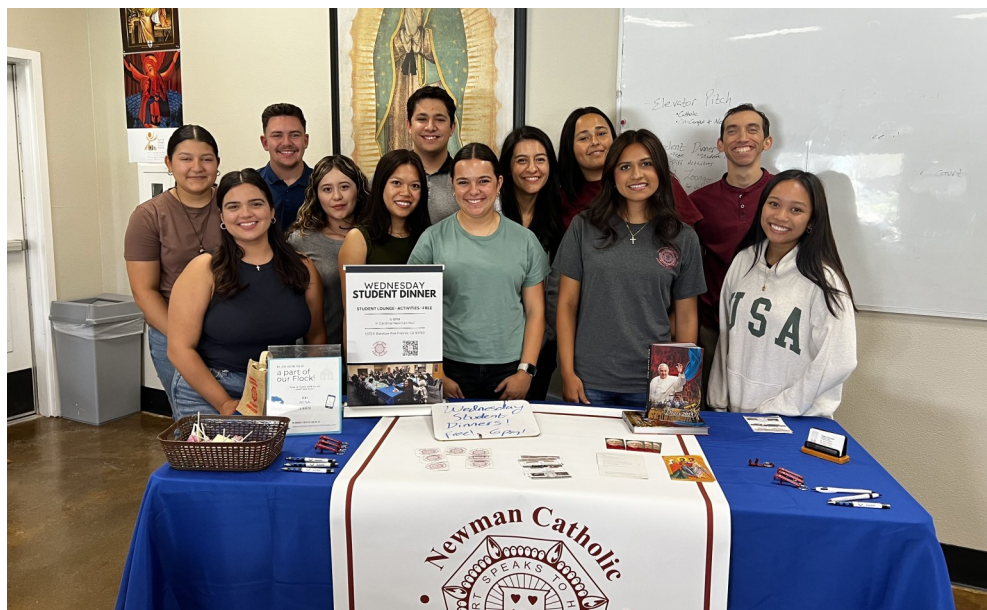
Campus Ministry Leadership met for orientation to prep for the new school year.