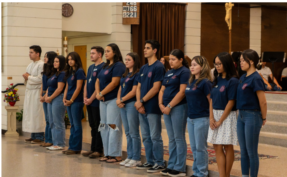
The Campus Ministry Leadership received a blessing during Welcome Weekend!